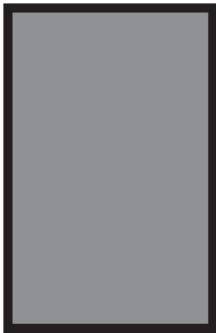
FULL PAGE (10" X 16")